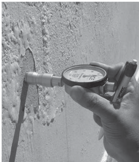
Figure 12: Durometer test.

and then more porous and permeable. The reduced ventilation in the interior of building worsened the situation (Veiga and Tavares, 2002).