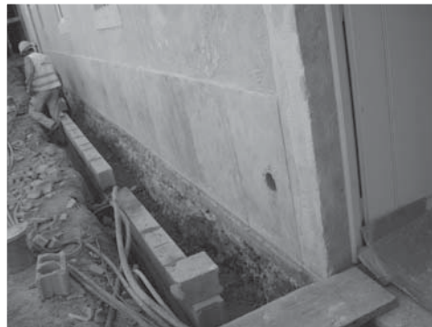
Figure 13: Execution of a ventilation ditch near the building façade.

b Render 3 months after application, in good conservation state, tested in another study (Veiga et al , 2009).