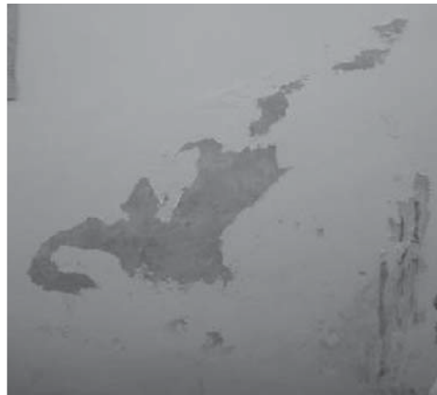
Figure 6: Detachment of the render painting.