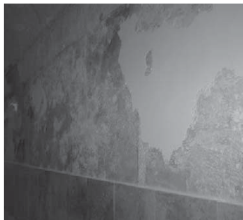
Figure 5: Detachments (large lacuna) of internal finishing.