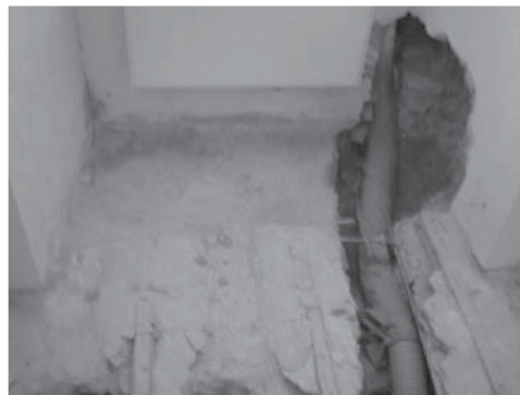
Figure 16: Introduction of the ventilation tube in the underground tunnels.

exterior (Figures 15 and 16) with the purpose of preventing capillary rise. In order to promote air circulation, electric fans were installed in the exterior ventilation ditches.