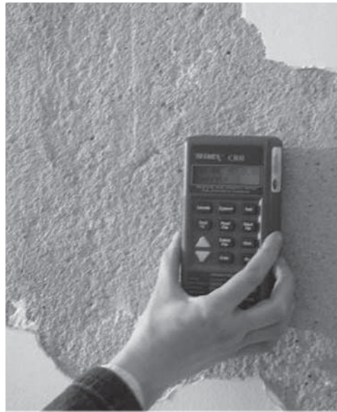
Figure 9: Evaluation of the moisture content with portable humidimeter.

from foundations as well as moisture from the roof vaults. They also show the effect of some particular constructive issues that favor water retention.