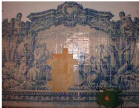
Figure 3: Lacuna in the interior glazed tiles ('azulejos') showing the old lime plaster.

foreigners, especially Spanish people, came to study at this institution. Only in the late nineteenth century, in 1898, was the decorative program of the church finished.