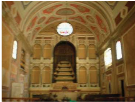
Figure 2: Church with lime plaster simulating marble.