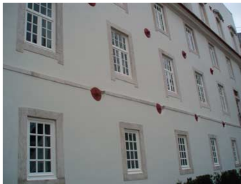
Figure 20: General view of the final appearance of the East Façade finishing.

be painted for at least 2 years to improve the evaporation of the water retained inside the vaults and walls. A gap between the floor footers and the walls was created for ventilation of the interior walls, to allow for continuous drying of masonry over time.