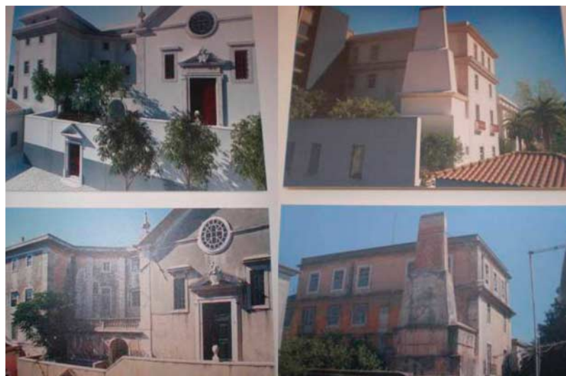
Figure 1: Inglesinhos convent: views before and after the intervention.

In 1755, the great Lisbon earthquake took place, resulting in the building suffering several areas of damage, and thus it underwent various interventions. By the eighteenth century the English College had built a high reputation in the Iberian Peninsula, and many