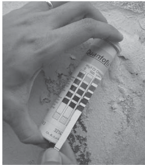
Figure 10: Strip tests – semi-quantitative determination of salts.