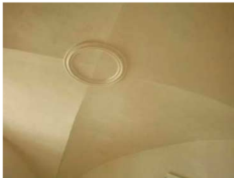
Figure 19: Application of traditional plaster on the ceiling of apartment 4.6.

coat, consisting of a thin air lime mortar, executed with siliceous sand and calcium carbonate, with volumetric dosage 1:3 (lime:aggregate), was carefully applied, with a soft squeeze with a mason trowel and periodic sprinkling of water (Figures 17 and 18). It was left to dry for 1 month before the application of the final paint.