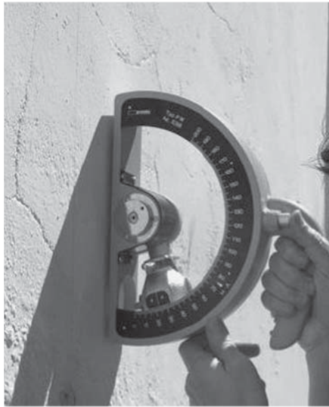
Figure 11: Pendular Schmidt impact hammer test.