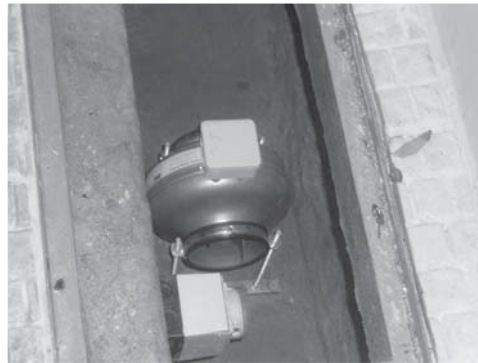
Figure 14: Electric equipment to force ventilation.