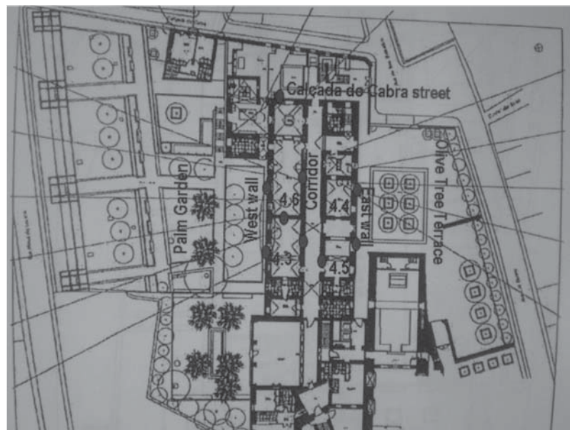
Figure 7: Plan of the ground floor with the tests localization.