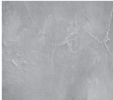
Figure 4: Efflorescences in the rendering cracks.

Several anomalies appeared after application of the new renders and plasters: dark moisture stains, salt efflorescences, loss of cohesion of the paint, blisterings and detachment of the paint (Figures 4–6).