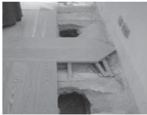
Figure 15: Small tunnels were opened under the ground floor.