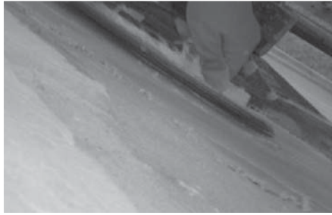
Figure 17: Application of the lime finishing coat.