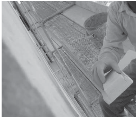
Figure 18: Finishing with the passage of a polystyrene sponge on the mortar.