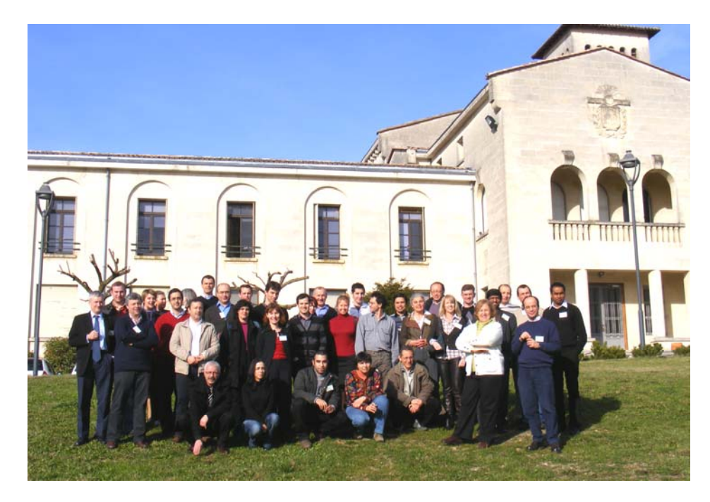
This is the 4st edition of the DURATINET Newsletter. The Newsletter is one of the ways developed in the project for communication and dissemination of information on project activities. The format of the newsletter is mainly designed for online download

Civil engineering is housed at the Institute for Mechanics and Engineering. It deals with: Construction materials (asphalt mix, concrete, stone and wood), their evolution and environmental conditions and loadings; evaluation of sites, works and substructures (NDT, diagnostics, geophysics, reliability, maintenance); Interaction of site and works with their environments (natural site evaluation and modelling, soil structure interaction).