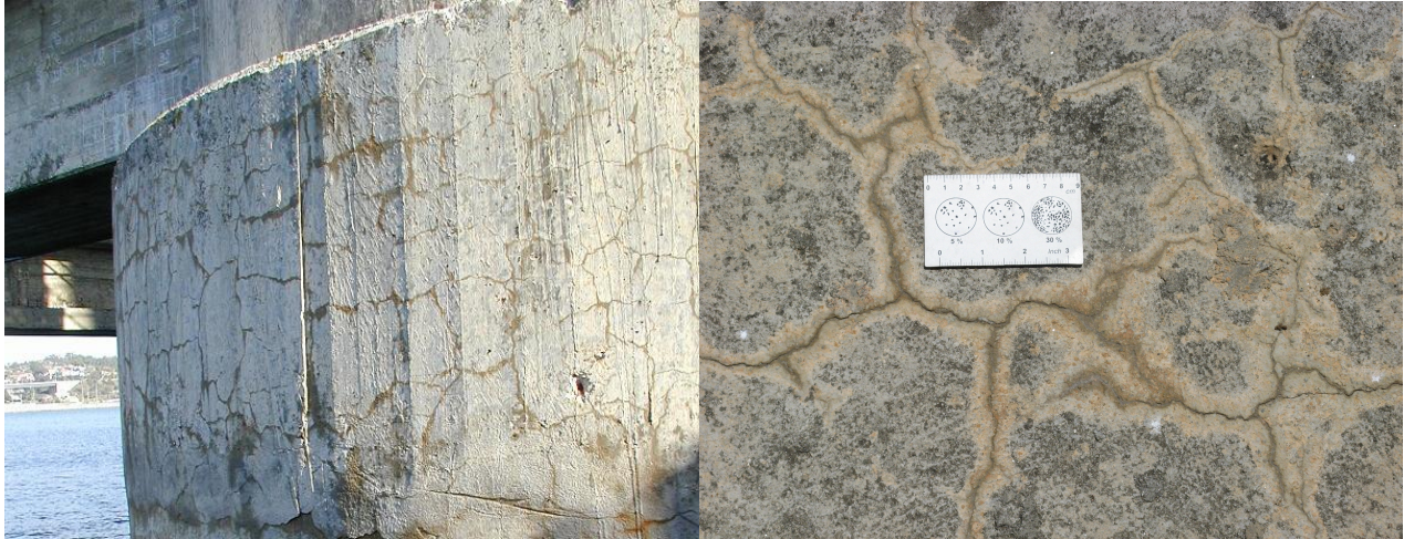
Figure 1. Typical visual symptoms of internal expansive reactions affecting concrete structures.